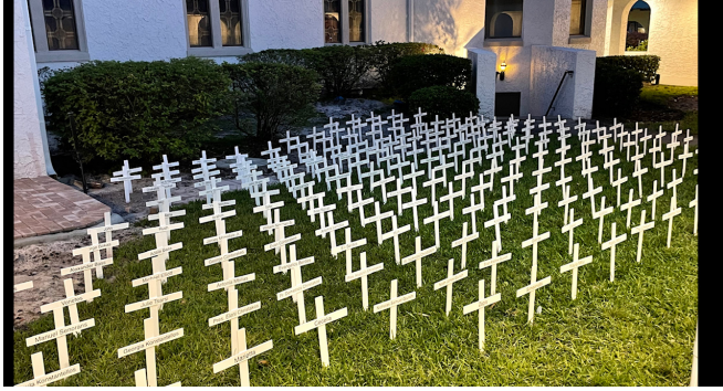
2022 Actual Photo